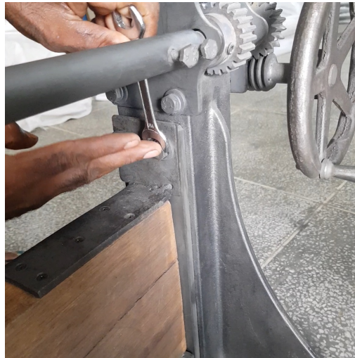
Step 3. Tighten the 4 bolts(2 on top and 2 on bottom) using spanner.