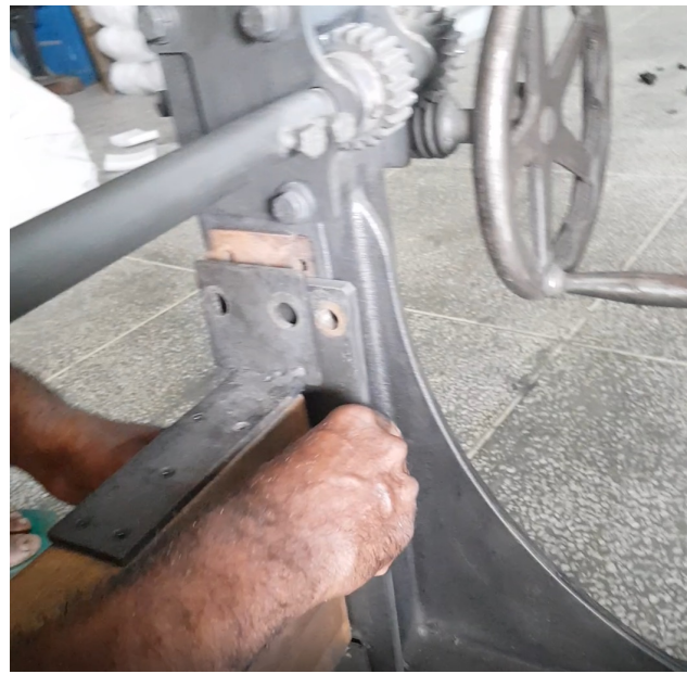
Step 2. Insert the Iron plate making Sure all the holes are aligned.