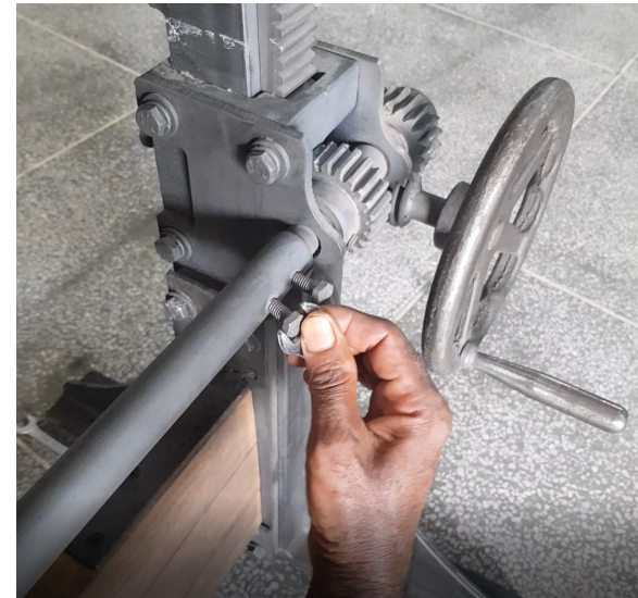
Step 4. Tighten the 2 stretcher Bolts using spanner.