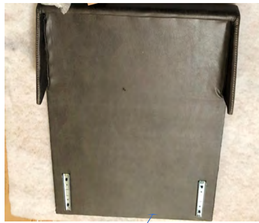
Chaise Back Guides

Step 5 – Attach electrical connection to chaise Recliner: plug power cord to wall electrical plug