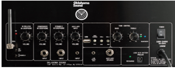
AMPLIFIER CONTROL PANEL