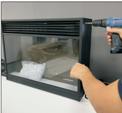
3. Unscrew all the screws on the fireplace core frame