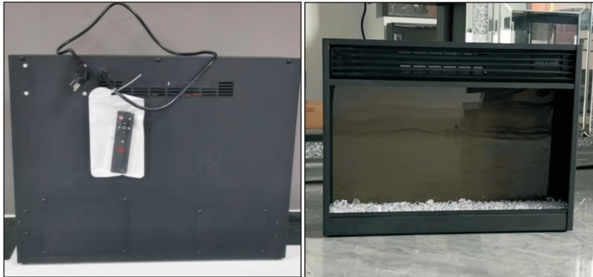
2. Take out the fireplace core from the front of the TV cabinet