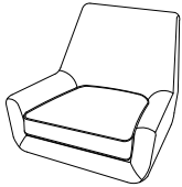
A. Reversible Cushion complete