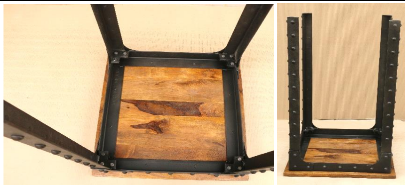
IMAGE SHOWING ATTACHED ALL LEGS

# Attach each of leg according to same marked numerics by nut/bolts help of wrench