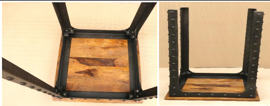
IMAGE SHOWING ATTACHED ALL LEGS

# Attach each of leg according to same marked numerics by nut/bolts help of wrench