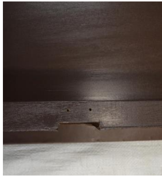
STEP : 2