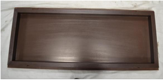
STEP : 1