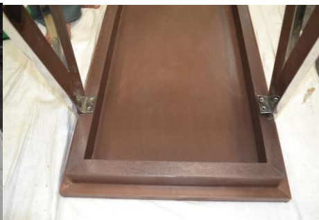
STEP : 5