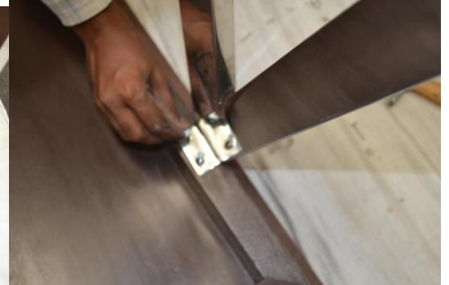
STEP : 6