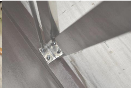
STEP : 7