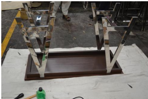
STEP : 4