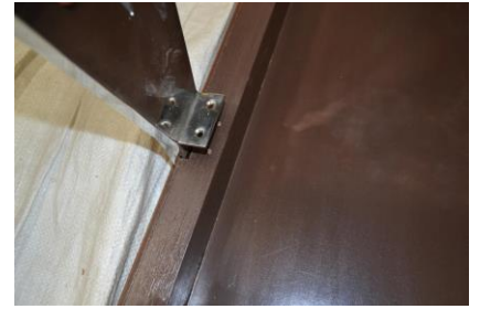
STEP : 3